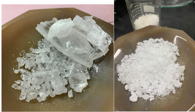
Figure 1- (a) CsI solid after zonal refining and (b) after the mass of crystals are macerated.

After purification by zonal refinement of the CsI salt, Thallium Iodide was added and then the crucible was taken to a vacuum for the thermal treatment of the salt. Iodine was added to the crucible inside a glove box in an argon gas atmosphere, in order to prevent oxygen from entering the crucible. The addition of iodine is intended to compensate for any loss of saline iodine caused by evaporation.