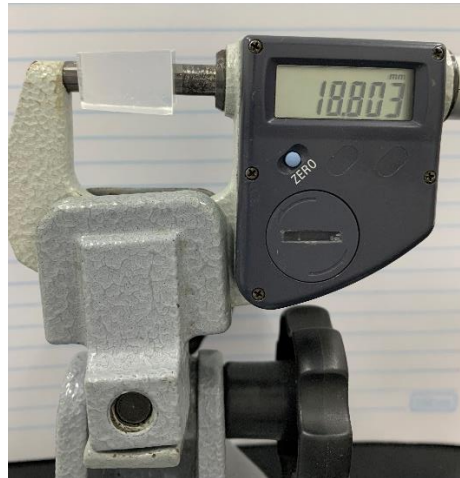
Figure 2 (a) CsI crystal (Tl) after the Bridgman method. (b) CsI crystal (Tl) after heat treatment. (c) CsI (Tl) crystal in cutting process. (d) Final geometry of the CsI (Tl) crystal.