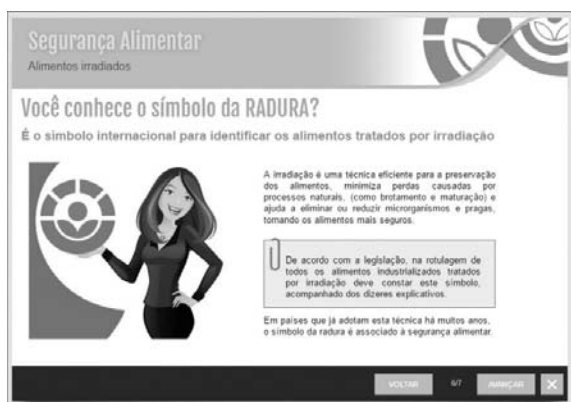
Fig. 2 Informing the general public: concepts about food irradiation

visitor. According to the equipment and resolution of the screens, the layout automatically adjusts for best viewing and better use of educational resources designed for the transmission of each content, as seen in Fig. 4.