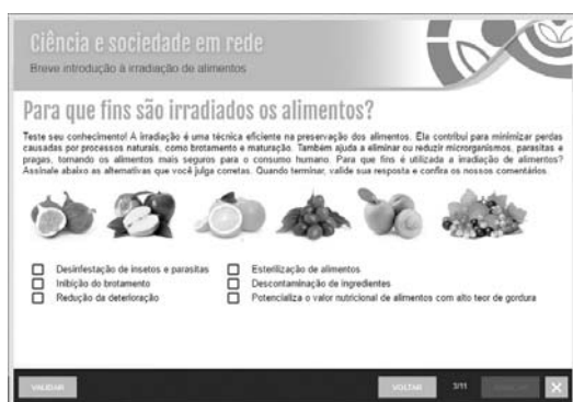
Fig. 3 Interactive exercises to check public's previous knowledge